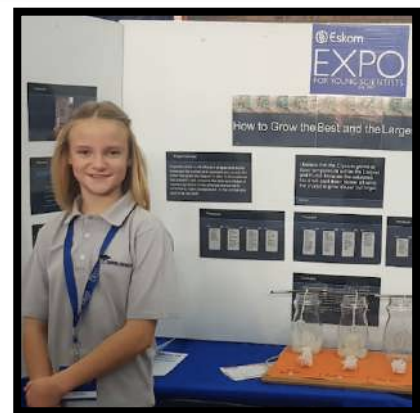
The Kira at Science Fair